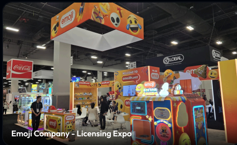
Emoji Company - Licensing Expo