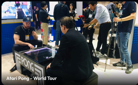
Atari Pong - World Tour